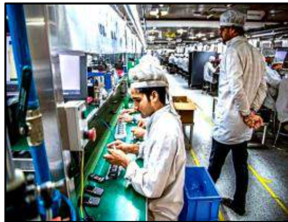
II BSC CS students at Flex India Private Limited, Sriperumbur