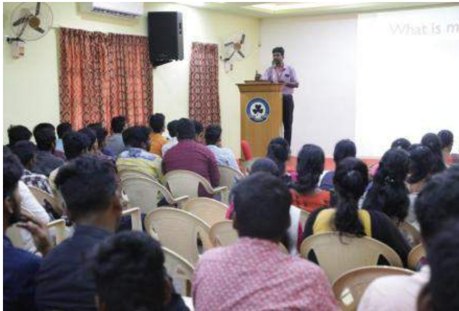
Resource person from Providers Skill Academy Pvt. Ltd. addressing the students