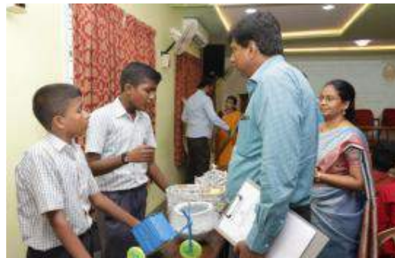
Students from various schools exhibiting their project models

Models such as Smart Dustbin, Automotive Crack Detection for Railway Track Using Ultrasonic Sensors, Room Heater, Taser band, etc.