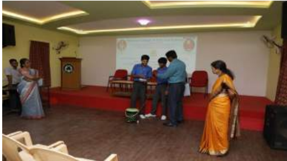
Students from St.Michael's Academy exhibited the Arduino Project – Smart Dustbin