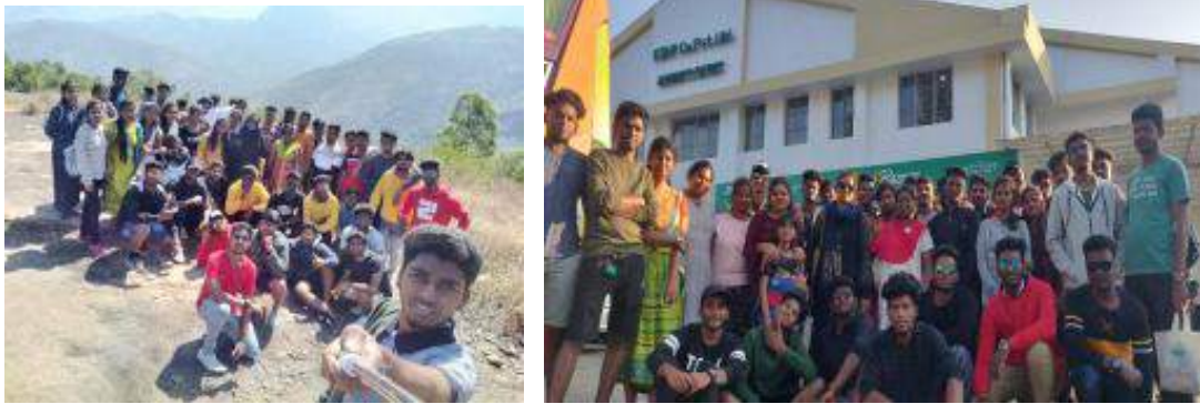
Students and Faculty during the study tour

Educational Tours for students provide them with an opportunity to collaborate with teachers, and integrate new perspectives with informal environments to enhance learning initiatives. Study tour emphasizes experiential learning and offer both group and self-directed activities that enable learners to explore various industries cultures, practices and people. About 42 final year students went for the study tour to Kanthalur-Munnar from 17 th Feb to 20 th Feb 2020.