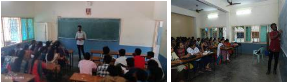
Alumni Mr.Vignesh interacting with the students in the training program

Another alumni interface program was conducted by our alumni Mr.Vignesh, batch 2015-2018, for three days on 4 th , 9 th and 10 th Oct, 2019. The session was about the training program on Network links, nodes and communication protocols. The session was interactive and informative to the students. Around 60 students from the department were benefitted. At the end of the training, a Questionnaire was given to students and they were asked to give the feedback about the session.