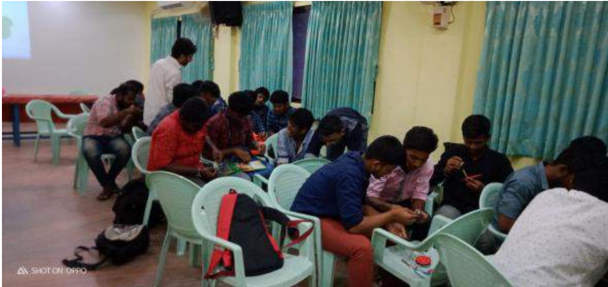
Students creating a Robotic Model with the Kit given