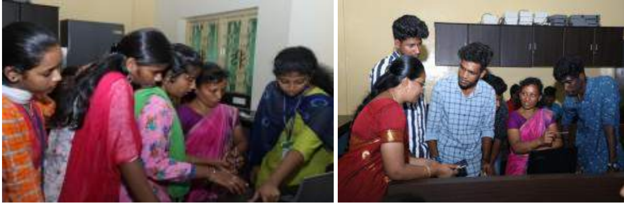
Students from the department presenting demo on their projects