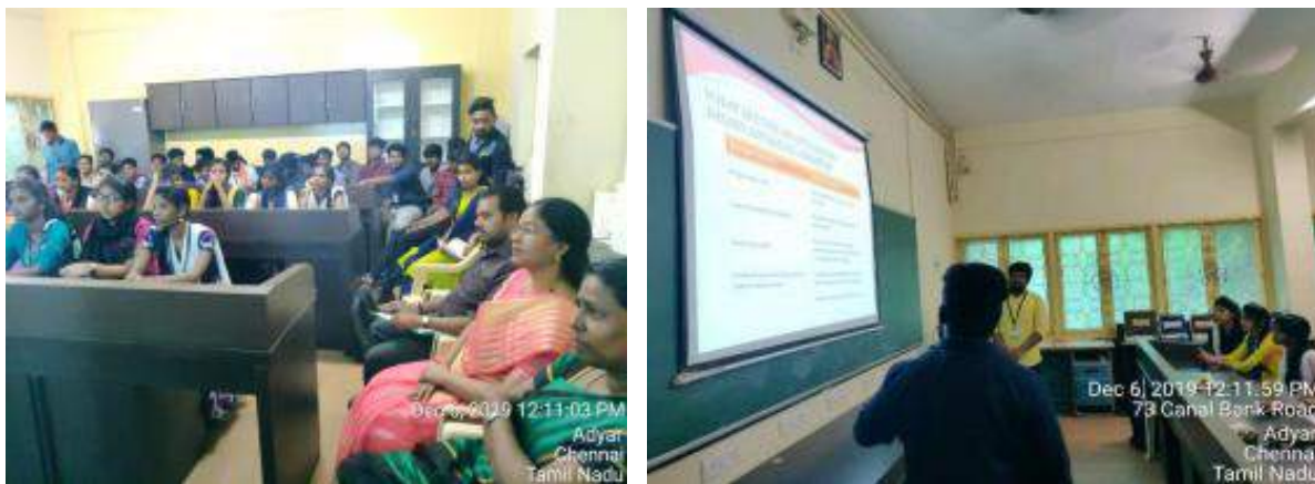
Students presenting their presentations on various technical topics